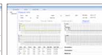
Data Review - Report