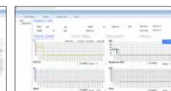
Data Review-Trend Chart