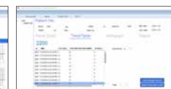
Data Review -Trend Table