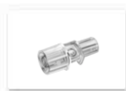
Neonate Airway Adapter