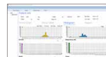
Data Review - Histogram