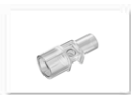
Adult/Pediatric Airway Adapter