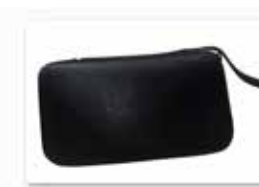
Hard Carry Case