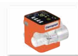
Protective Silicon Bumper