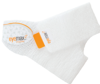
PREEMIE (10.4"-12.6") (Occipital Frontal Circumference)