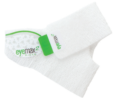
MICRO (7.87"-10.4") (Occipital Frontal Circumference)