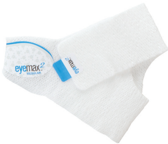
REGULAR (12.6"-14.9") (Occipital Frontal Circumference)

Helps to prevent irritant contact dermatitis