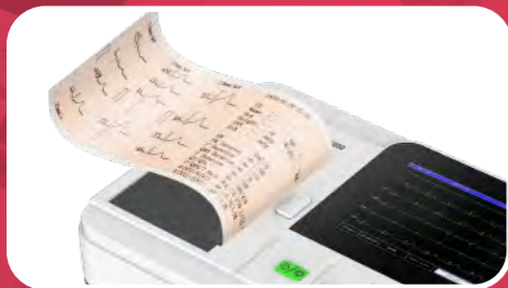
Thermal Printing System